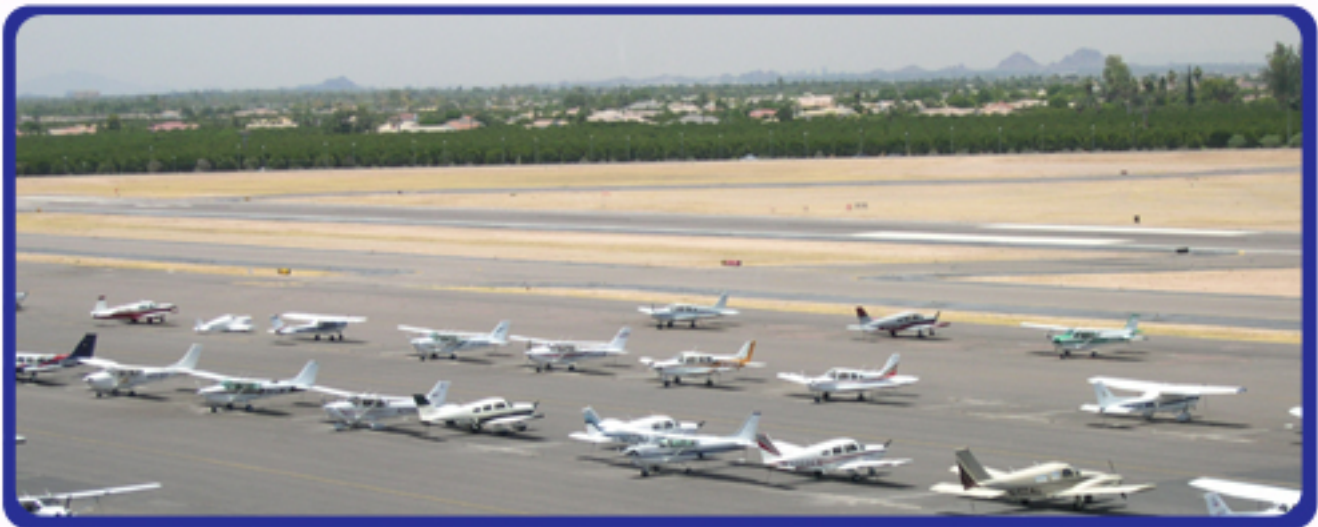
The ramp at Falcon Aviation in Mesa, AZ

Is this plane more than 4 times valuable than my plane? Good Question. Sport planes have been selling well and this one flies like an American plane – solid, no surprises, no bad habits, not ugly, acceptable performance and a good compromise.