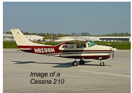
Image of a Cessna 210